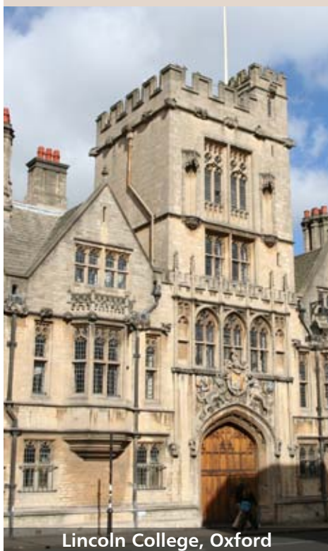
Lincoln College, Oxford