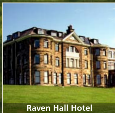
Raven Hall Hotel